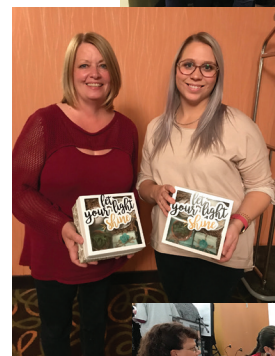
Winners from the "Get to Know You" game