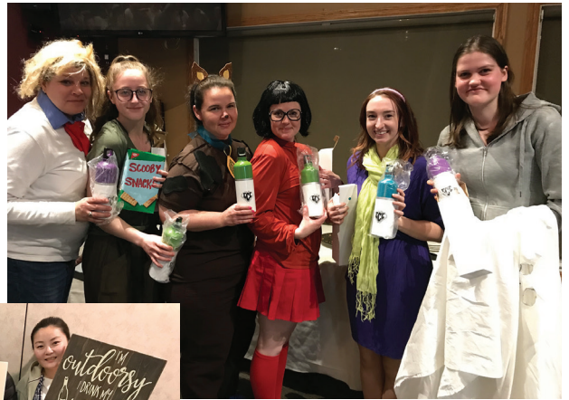
Oakbank Kids Korner wins for best costumes in Scavenger Hunt