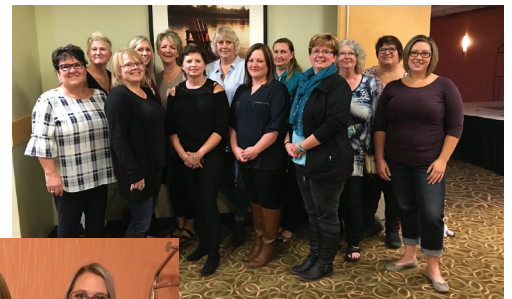
Directors from Westman Region