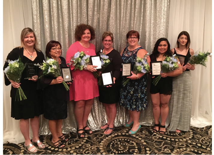
2018 Award Recipients

At the conference banquet we acknowledged MCCA members for 5+ years working in the child care field.