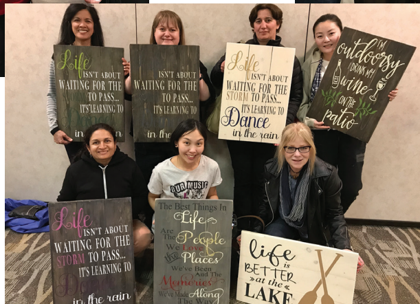
Such beautiful signs