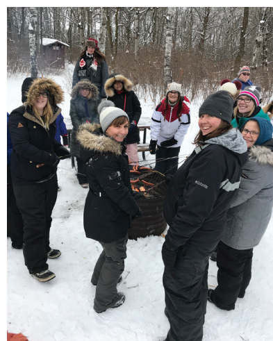
Time for a weiner roast after the sleigh ride