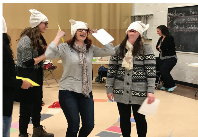
Human Board Game