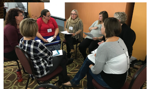
Networking at the Directors Conference