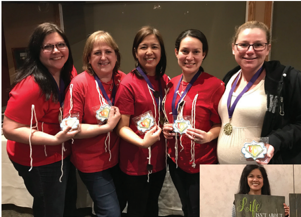
Day Nursery wins 1st place In Scavenger Hunt