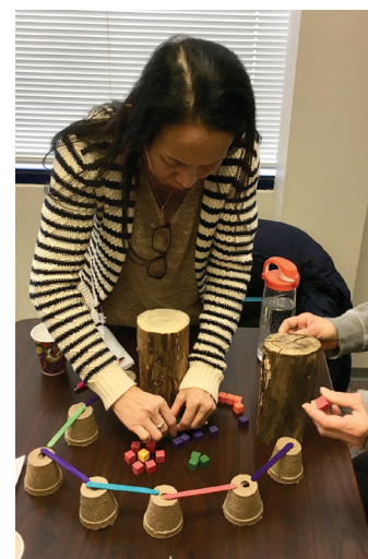
Schema Theory Investigation