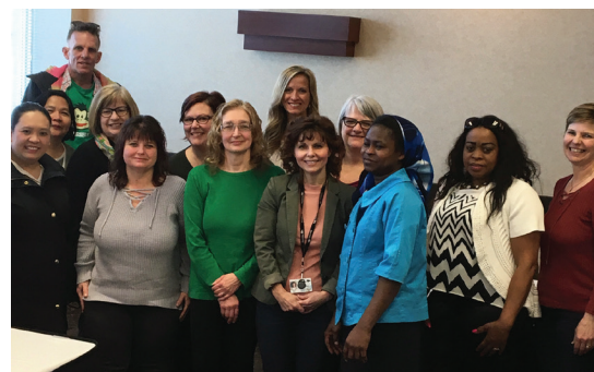
Family Child Care Brunch N Learn

Sister MacNamara Day Care Sugar N Spice Kiddie Haven Fairlane Children's Centre Dawn & Dusk Before and After Ecole Centrale School Age Centre K.I.D.S. Inc. Little Peoples' Place Lac Du Bonnet Children's Centre Military Family Resource Centre Lindenwoods Child Care Centre PCC Prairie Children's Centre Carpathia Children's Centre Freight House Early Learning and Care Seven Oaks Child Day Care East Transcona Before & After Westgrove Children's Centre Lakewood Children's Centre Westman region Norman region